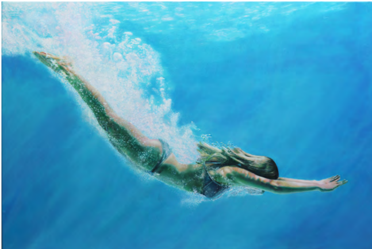
Matt Story, "Silver Dive", Oil on Wood Panel, 24 x 36

Complimentary Admission for Two (Registration required. Complimentary admission available during regular fair hours only.)